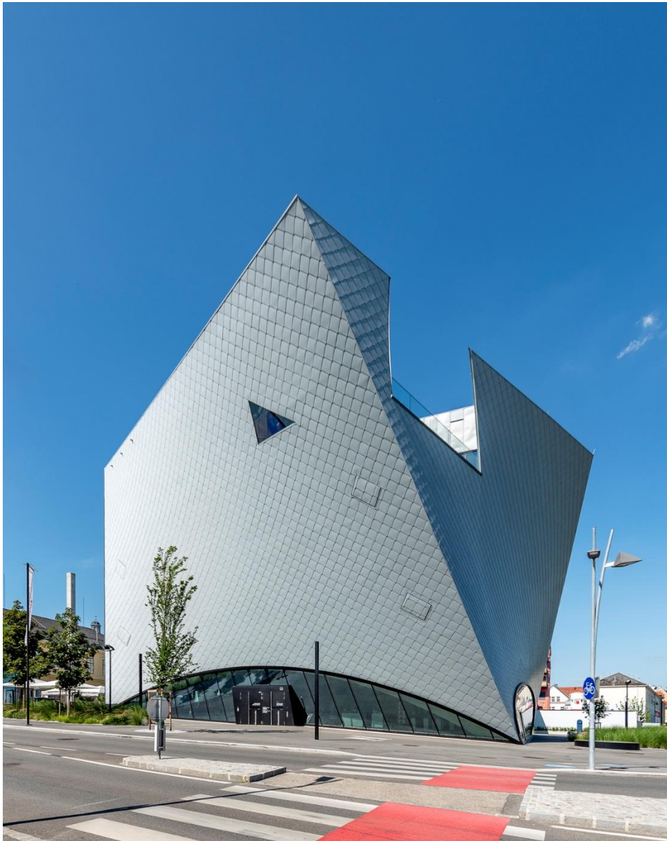
State Gallery of Lower Austria, 2021